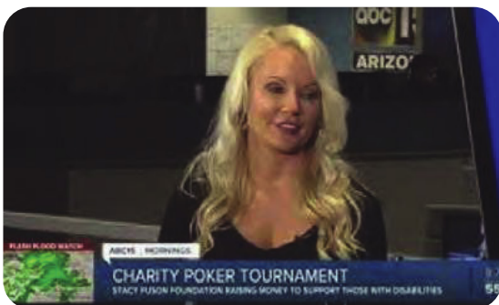
ABC 15 Interview