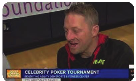
CBS 3 Interview