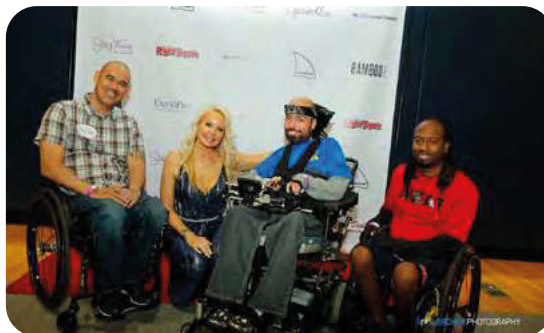
What We Do