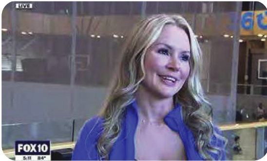
Fox 10 Interview