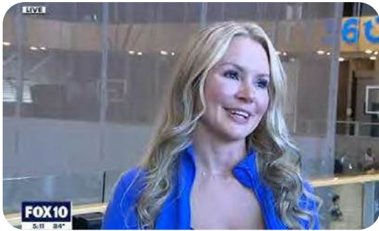
Fox 10 Interview