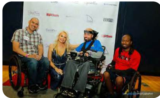
What We Do