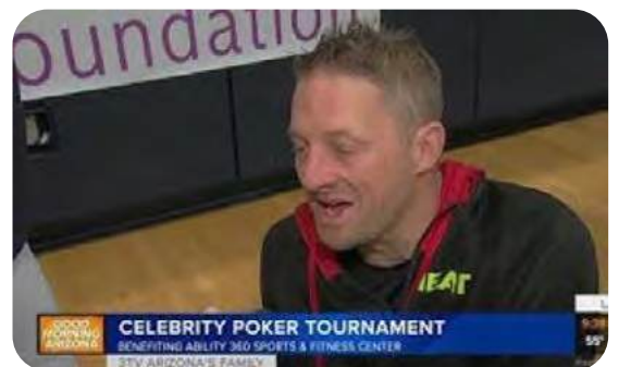
CBS 3 Interview