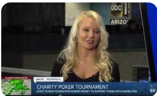
ABC 15 Interview